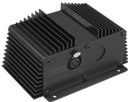
SAVI STAND ALONE CONTROLLER

The SAVI-512 STAND ALONE CONTROLLER , is a fully functional DMX Control and software system that allow you to create custom lighting scenes, shows, or effects. USB or ethernet interface is specifically equipped with memory which allows it to work in Stand Alone mode in case of PC-failure or restricted use. In Stand Alone mode the SAVI-512 STAND ALONE CONTROLLER is equipped with a connector which allows it to be externally-powered (120VAC to 9.0-15Vdc, @ 600mA or 240VAC to 9.0-15VDC, @ 600mA). In Stand Alone mode, the interface can release up to 255 scenes which will be called back in numerical order by pressing "Previous" or "Next". Each of these scenes can have up to 1000 steps. Individual scenes can be assigned to a particular Play-back/ Recall button, 1-8. Due to its very competitive price and its remarkable performance and mini-size, this product is ideally suited for small or large-scale settings including stores, restaurants, hotels, clubs, architectural lighting, parks or exhibitions.